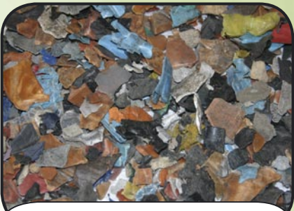
PVC + metals.