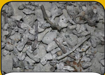
Slag + metals.