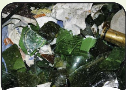
Glass + metals.