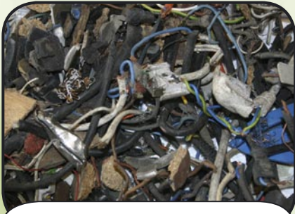
Electrical scrap + metals.